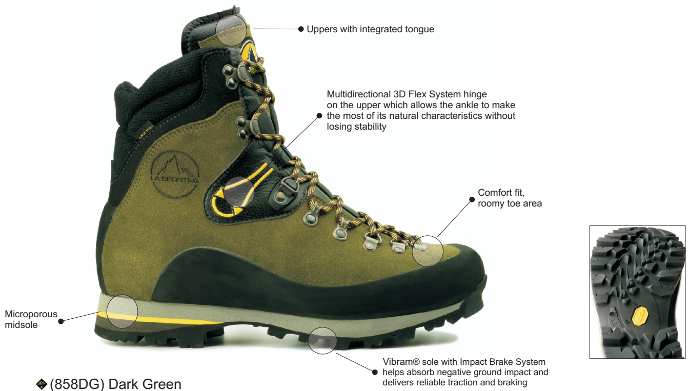
◆ (858DG) Dark Green